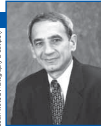
Sarah Merians Photography & Company