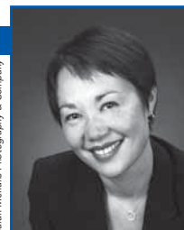
Sarah Merians Photography & Company